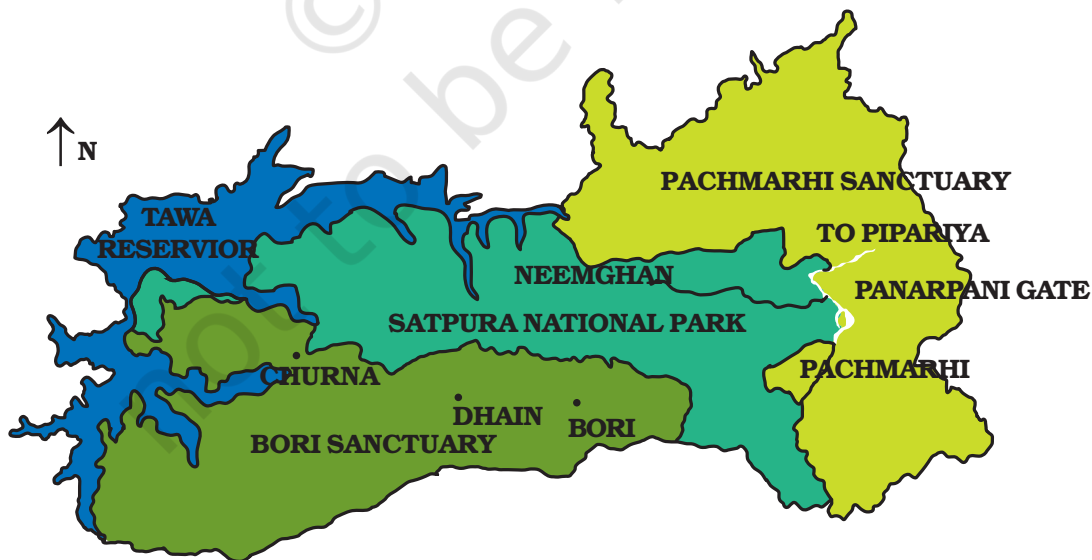
Fig. 5.1 : Pachmarhi Biosphere Reserve