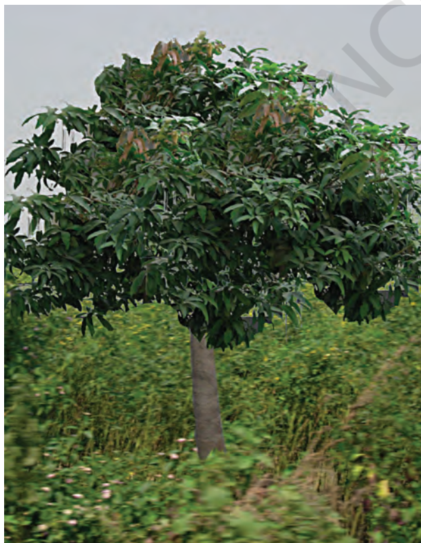
Fig. 5.3 (a) : Wild Mango

Madhavji shows sal and wild mango (Fig. 5.3 (a)) as two examples of the