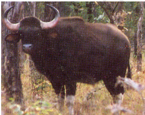
Fig. 5.5 : Wild buffalo

buffaloes (Fig. 5.5) and barasingha (Fig. 5.6) were also found in the Satpura National Park. Animals whose numbers are diminishing to a level that they might face extinction are known as the endangered animals . Boojho is reminded of the dinosaurs which became extinct a long time ago. Survival of some