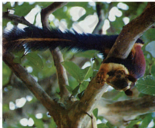
Fig. 5.3 (b) : Giant squirrel

endemic flora of the Pachmarhi Biosphere Reserve. Bison, Indian giant squirrel [Fig. 5.3 (b)] and flying squirrel are endemic fauna of this area. Professor Ahmad explains that the destruction of their habitat, increasing population and introduction of new species may affect the natural habitat of endemic species and endanger their existence.