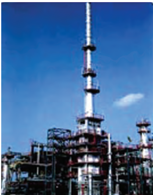
Fig. 3.5: A petroleum refinery

separating the various constituents/ fractions of petroleum is known as refining. It is carried out in a petroleum refinery (Fig. 3.5).