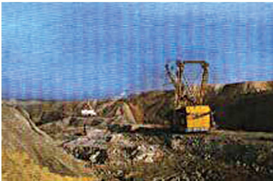
Fig. 3.2: A coal mine

When heated in air, coal burns and produces mainly carbon dioxide gas.