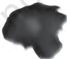
Fig. 3.3: Coal tar

It is a black, thick liquid (Fig. 3.3) with an unpleasant smell. It is a mixture of