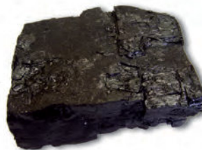
Fig. 3.1: Coal

You may have seen coal or heard about it (Fig. 3.1). It is as hard as stone and is black in colour.