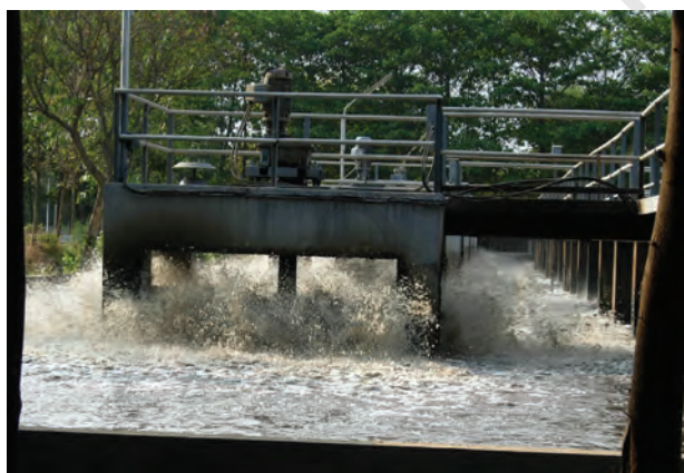
Fig. 13.6 Aerator

4. Air is pumped into the clarified water to help aerobic bacteria to grow. Bacteria consume human waste, food waste, soaps and other unwanted matter still remaining in clarified water (Fig. 13.6).