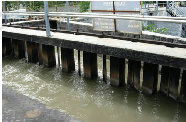
Fig. 13.4 Grit and sand removal tank