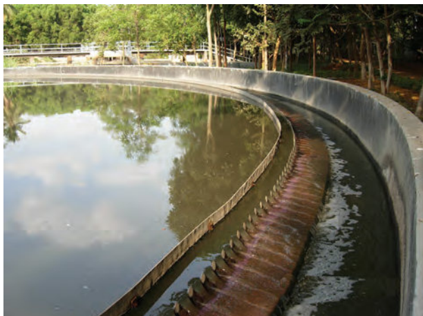
Fig. 13.5 Water clarifier

a scraper. This is the sludge . A skimmer removes the floatable solids like oil and grease. Water so cleared is called clarified water (Fig. 13.5).