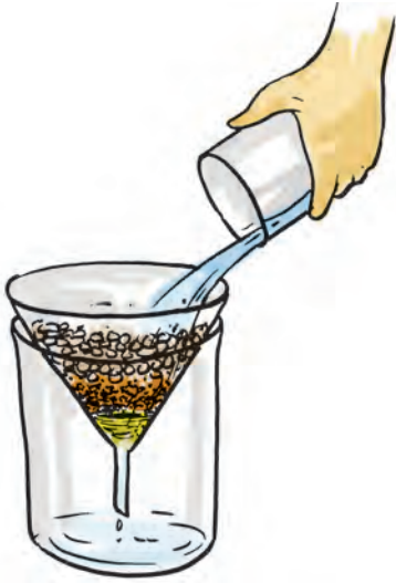
Fig. 13.2 Filtration process