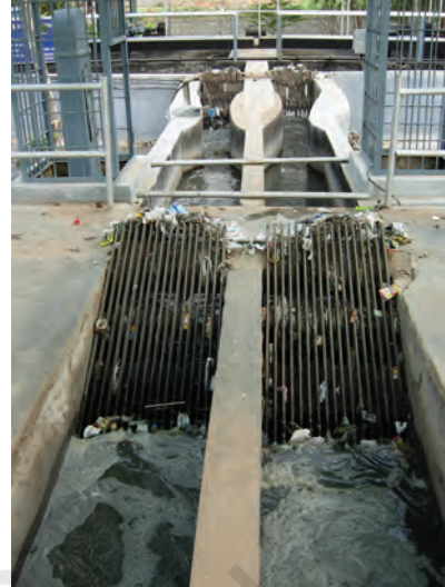
Fig. 13.3 Bar screen